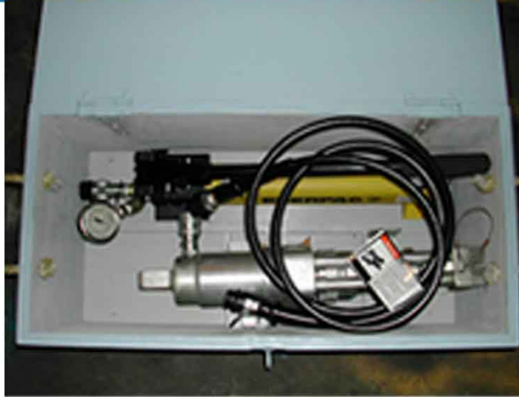
Standard RC-1500 Unit with P-1500 Hand Pump Assembly and 1501 Storage Box.

BORED STEEL CYLINDER CADMIUM PLATED FOR ALL WEATHER PROTECTION